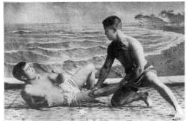
Poss. Nijushiho Kata Bunkai

So, by all means look at what is offered as Bunkai, but also look at the sources of this information and judge for yourselves if you believe that the demonstrators really deeply understand even the few points I have raised earlier. The final pragmatic test is (a) Does it work effectively under pressure? And (b) Does it conform to the underlying 'Rules of Combat' - the principles?