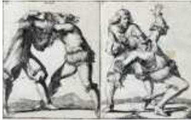
Bubishi & German Medieval Manuals

It is impossible to list all the difference here, but, for example: Original karate used the front hand as a weapon, modern karate front hand is used to block; Hikite originally was to pull an enemy onto a blow or to control him, modern karate uses it to aid punching power and speed; Blocks were originally two-handed, modern karate mainly uses one hand; original karate made great use of throws and control methods; modern karate only recently has allowed the use of a variety of throws in Kumite; original karate utilized different hand and fist types to attack the vital Kyusho points, these are generally not used in modern training; in original karate opponents were usually immobilized before being struck with blows, modern karate is more mobile against moving opponents; originally, karate taught methods of defense against a variety of weapons, modern Dojo karate does not, side-kicks and round-kicks are common in modern karate; they do not feature in original karate; original karate contained choking, strangling, locking and grappling methods, modern karate pays little or no attention to these aspects; originally Kata were supposed to be practiced after learning the Bunkai, modern karate does not do this and the Bunkai is mostly forgotten - the list goes on.